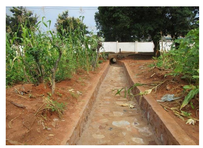
Extension of Pipe culvert outfall