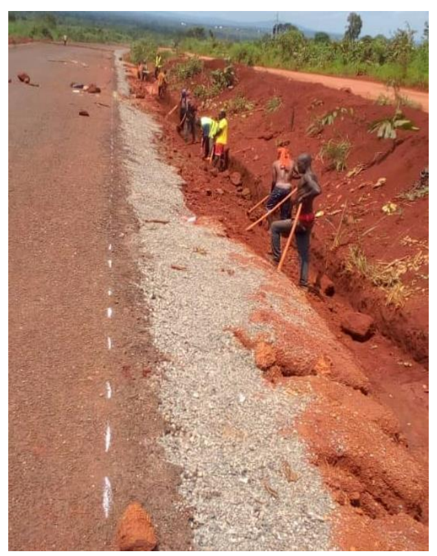
Trimming of excavations for concrete side drains