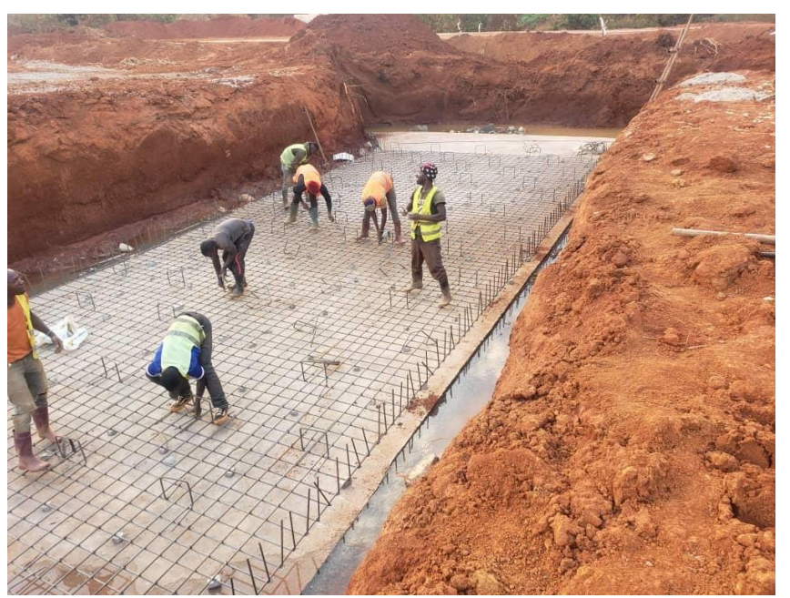
Preparation of bottom slab reinforcement after casting a blinding concrete in box culvert