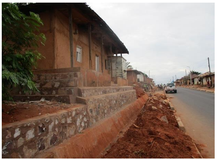
Stone Masonry-Protected house very close to the road