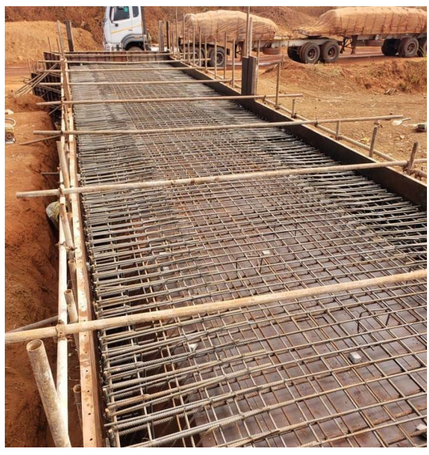
The casting of concrete in the process after fixing reinforcement and formwork for vertical walls and top slab