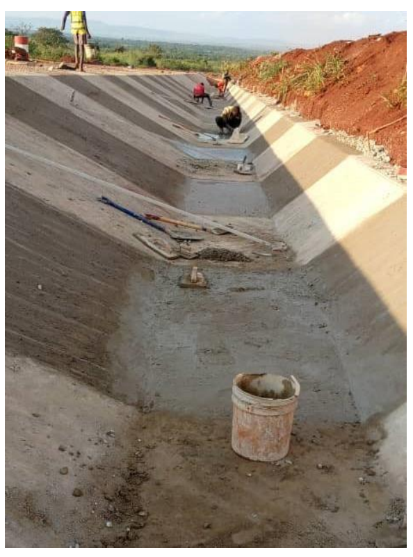
Cast and Class U2 surface finish for concrete side drain