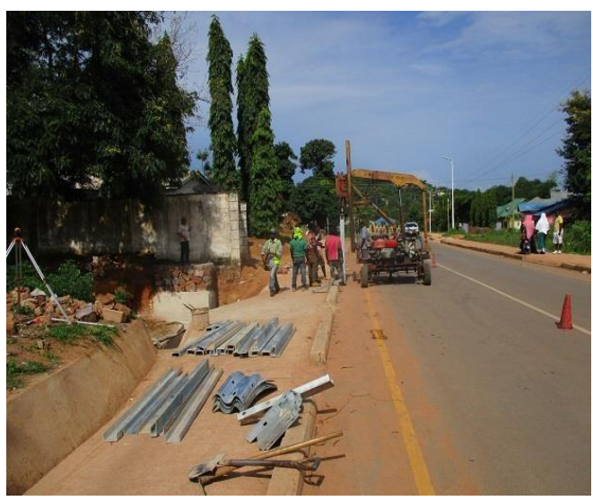
Fixing of Guardrail